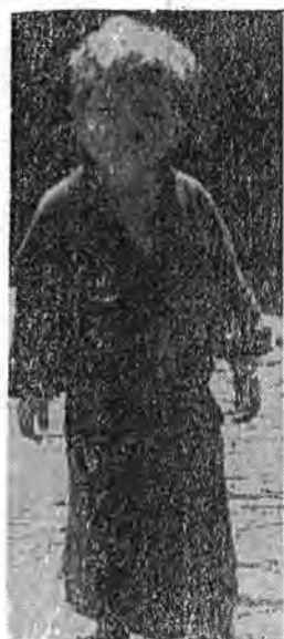
WHAT'S FOR ME? —A dirty-faced urchin from the Montagnard village of Plei Cham Reh watches anxiously as an Ivy Division civic action unit distributes fruit and gives medical assistance to his village.

The three men, part of the 3rd Brigade Task Force, 25th Infantry Division, and the 2/35th are in the Central Highlands on Operation Sam Houston.