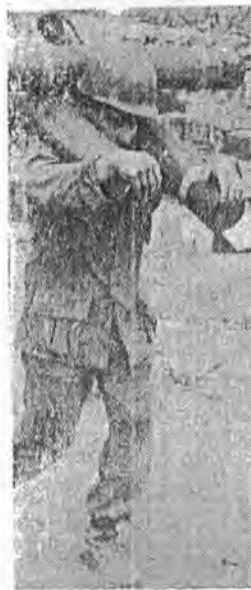
MAN-SIZED LOAD —That's 150 pounds of trouble for Charlie on the shoulders of an Ivymen from the 4th Battalion, 42nd Artillery.